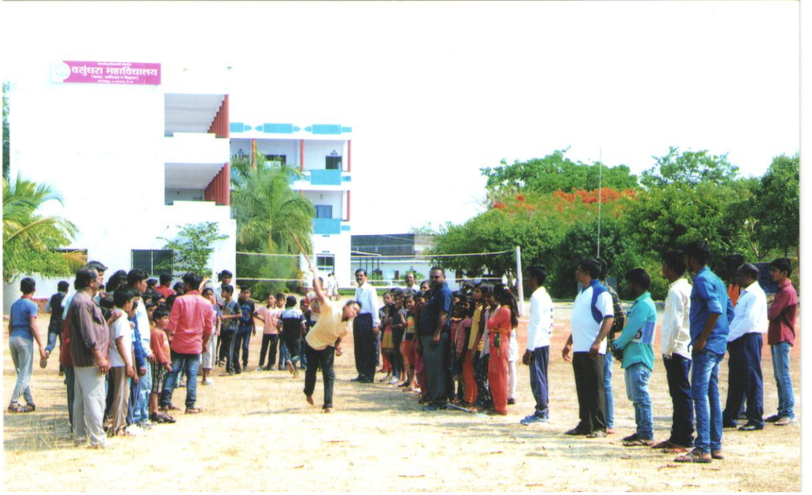
Vasundhara Krida Probodhini Summer Camp