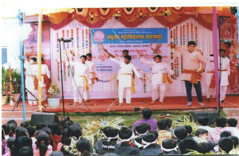
Artist's performance on the stage during Open Art Festival